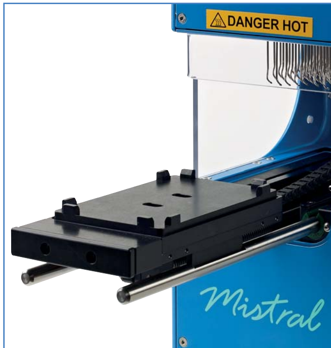
▲ An industry standard plate nest accepts all standard SLAS/ANSI footprint plates with heights up to 60mm and features positive plate detection. The extendable rails can reach up to 240mm in front of the Mistral for ease of integration with other equipment.

The evaporation table is able to rise under the control of a stepper motor as the drying process proceeds. This can be programmed at a suitable rate for each solvent type being evaporated. In addition, gas temperature, pressure and flow rate can all be programmed individually and stored in up to thirty multi-step programmes on the Ultravap Mistral controller. Each programme allows the table to rise in up to five distinct ramped phases, so that a fast initial drying period can be followed by a gentler final drying phase. The new Ultravap Mistral is usually located on the right-hand side of the robot deck. Control commands are sent directly from the robot controller to the Mistral. These standard commands are listed in the manual, but most robot manufacturers have drivers available to control the Mistral, making integration a seamless process.