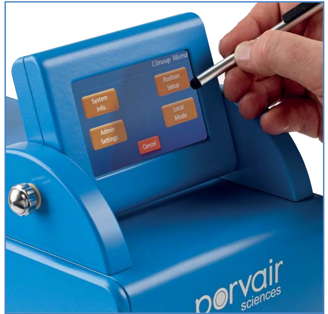
▲ All parameters can be programmed through the large colour touch screen display, using the stylus provided.